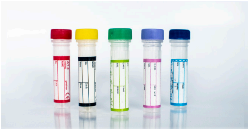
1.3ml Screw cap Tubes